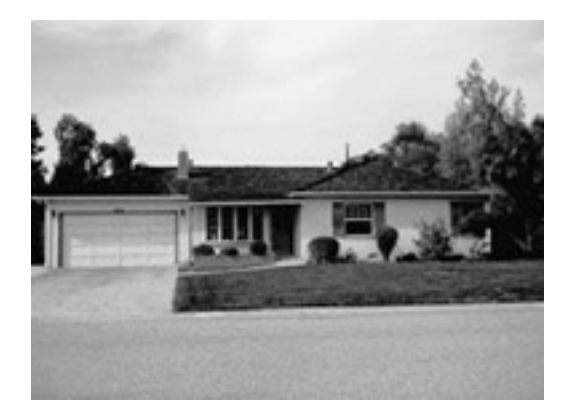
The Los Altos house with the garage where Apple was born