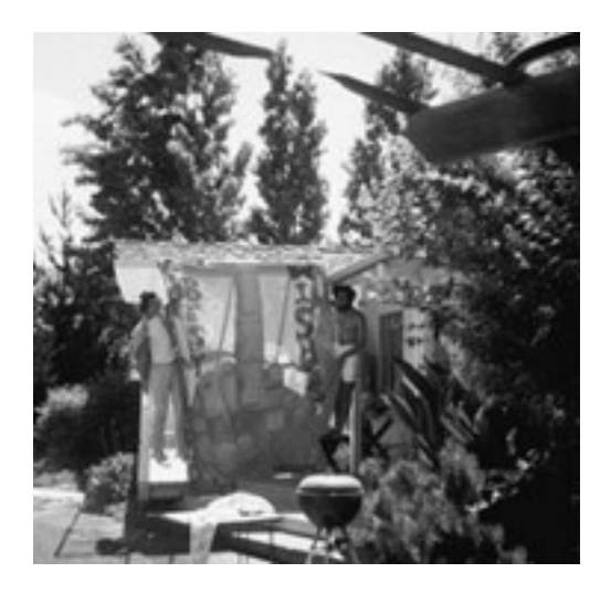
With the "SWAB JOB" school prank sign