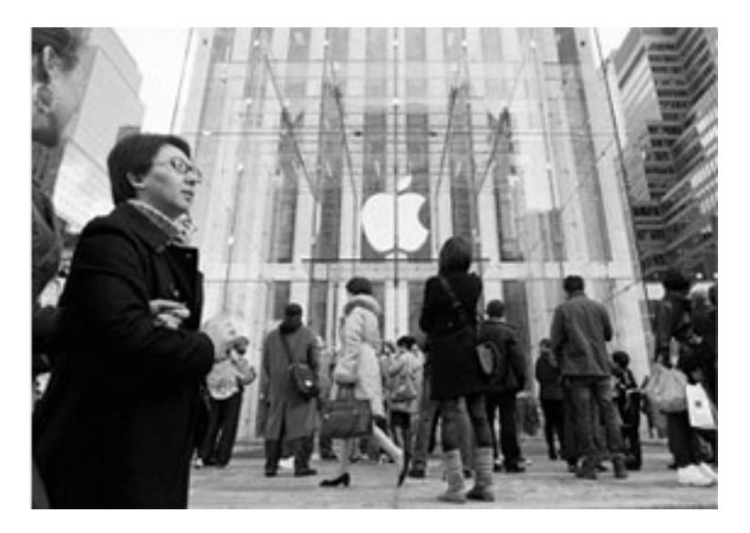
New York's Fifth Avenue store